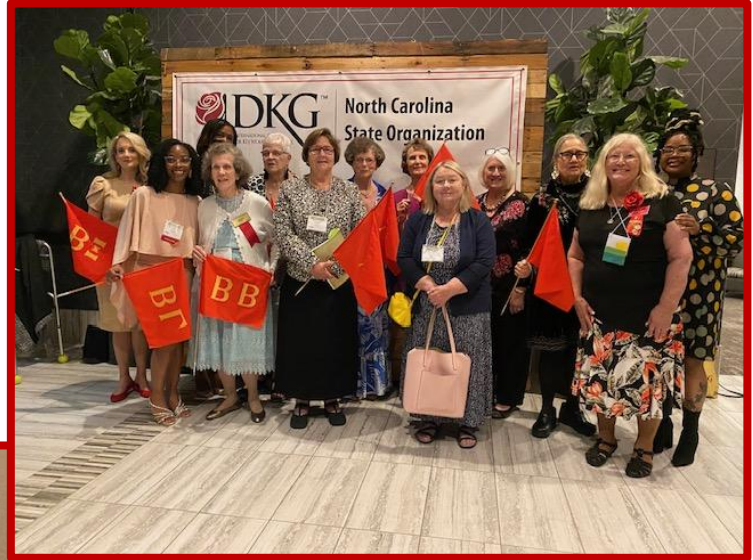
Group picture of NCDKG Region VII chapter presidents at 2023 convention